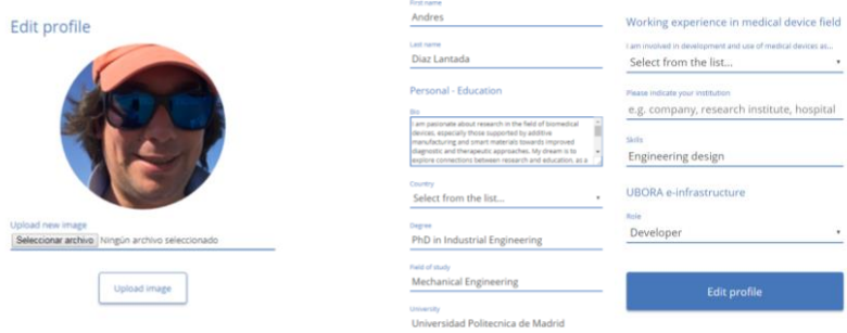
Figure 3: Example of user's information incorporated to the profile. No sensitive data (i.e. personal ID, address, phone...) are collected and only a contact email and name, which can be an alias, are needed.