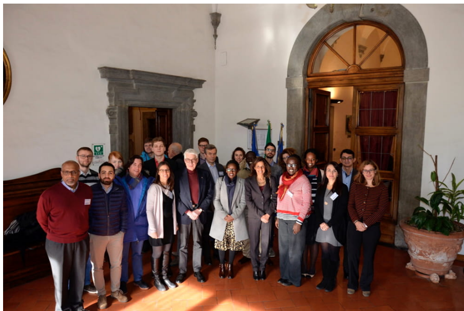
Figure 2. Team's picture during the UBORA project's kick-off meeting in Pisa (17 th Jan. 2017).