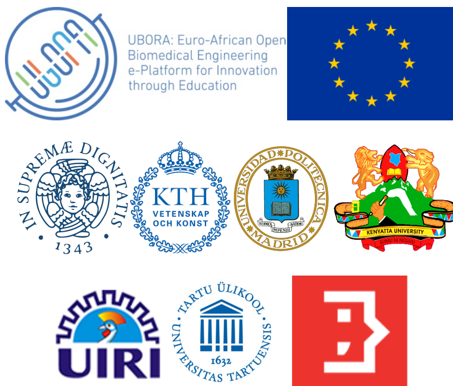
Figure 1. Logos from project, partners and support for dissemination tasks.