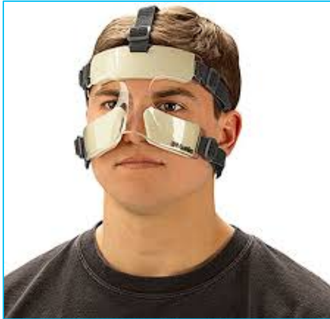
Custom made mask with high price.