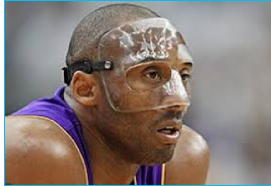
Usually made for athletic.